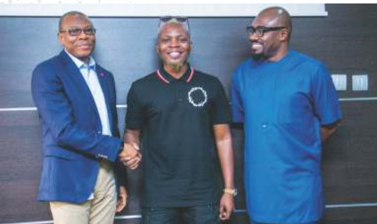
• MD, Sterling Bank and Chief Marketing Officer at the signing of Olamide as an ambassador for STEM

Since its inception 4 years ago in Lagos state, the Bank has successfully held the cleaning exercise in 14 states in the country with the highlight being the signing of Olamide, an artiste as the ambassador for STEM thus enhancing its impact on different socio-economic classes.