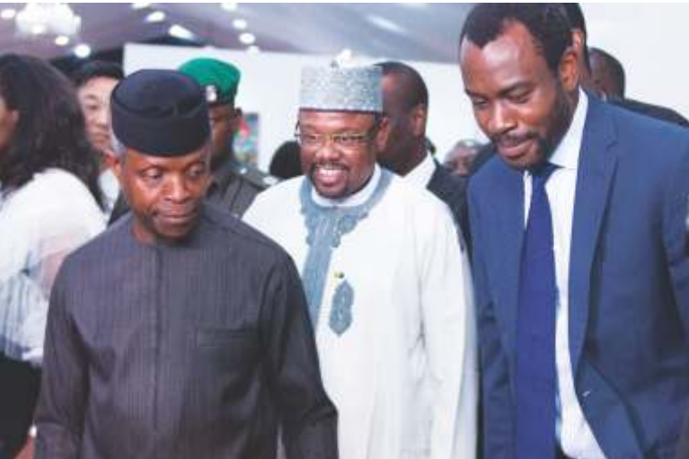
• The Vice president, Prof. Yemi Osinbajo at the display of the Recyclart artworks with the ED, Finance and Strategy at the African Culture & Design Festival art exhibition themed 'This is Africa'