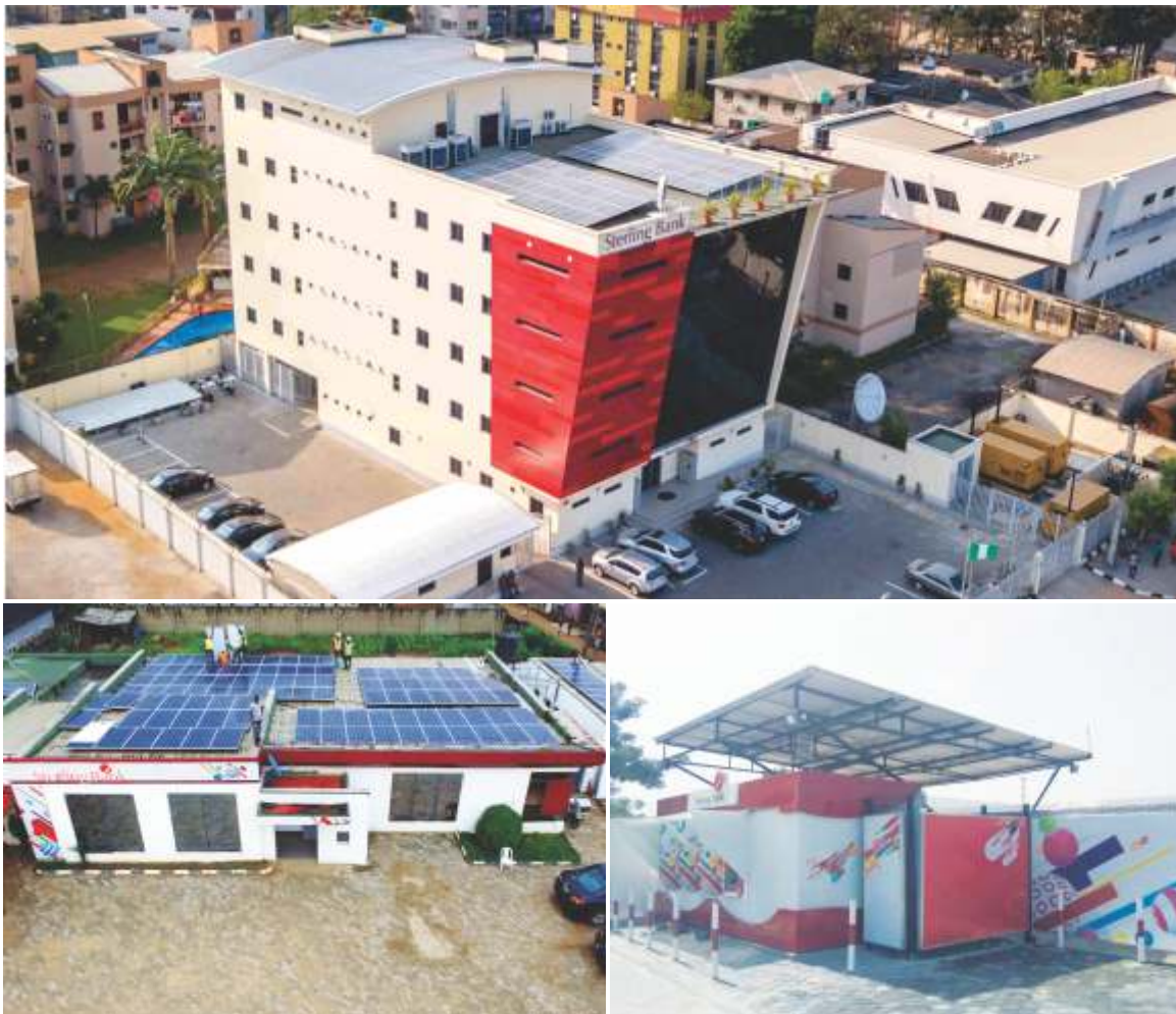
Top: The 45Kwh Hybrid Solar project installed at the Head Office Annex, Ilupeju, Lagos Bottom left: Deployment of hybrid power/ renewable energy at Magboro Branch, Ogun state Bottom right: Hybrid powered Offsite ATMs at Admiralty Way, Lekki, Lagos

The table overleaf shows the resource consumption for the bank over the last 2 years.