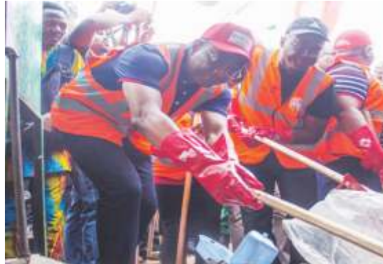
• At the Computer village – MD Sterling Bank and ED Operations and Services with the Honourable Commissioner of Environment, Lagos state.